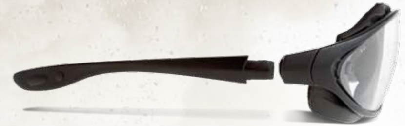
Flexible design can be used with temple or headband (both included).