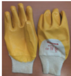
Reference standard :